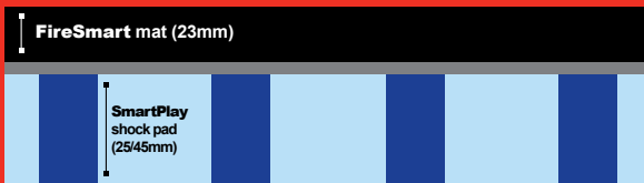
FireSmart system incorporating SmartPlay

In addition to our conventional FireSmart system, customers now have the option to use FireSmart with one of two SmartPlay systems (25mm or 45mm) which give excellent CFH results on concrete compared to conventional matting systems. Please check our website for more information.